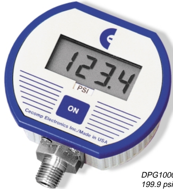
DPG1000B with 199.9 psig range