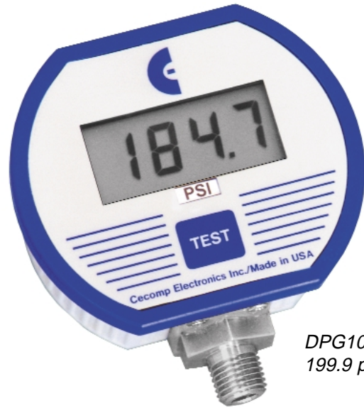
DPG1000DR with 199.9 psig range